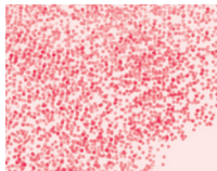
Healthy, untreated, oral mucosa cells.

Cell testing 2 in the oral mucosa has given the following results: